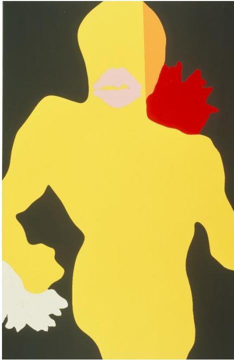
That Way (1993) gloss paint on panel, 122 x 79 cm